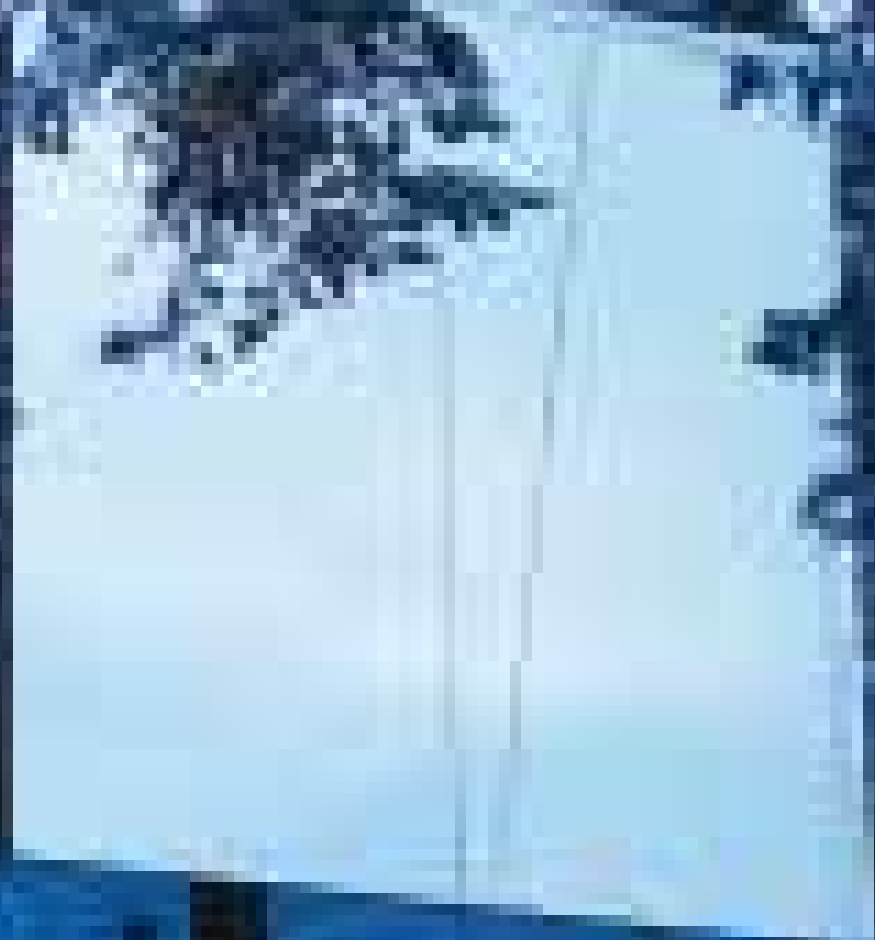
The Mirrorcube Treehouse, Sweden