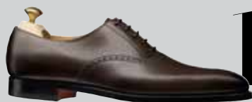
#1 Edgware Oxford, £390