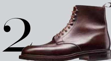
#2 Galway Boot, £440