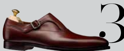
#3 Winston Monk, £525

All available at Crockett & Jones, 20-21 Burlington Arcade, W1J (crockettandjones.com)